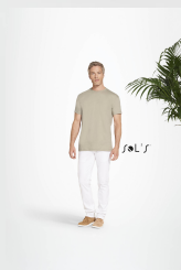
ORGANIC MEN 11980