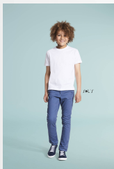
ORGANIC KIDS 11978